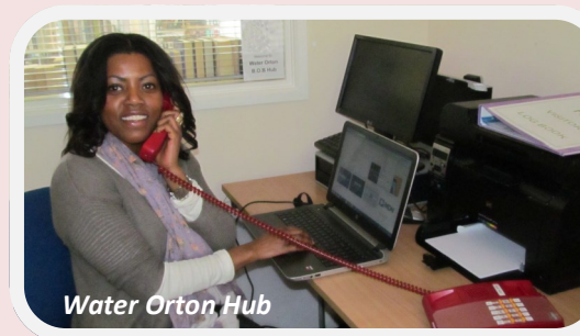
Water Orton Hub