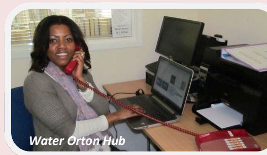
Water Orton Hub